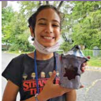
Ceramics Hand-building: Under the Big Top

Join us in a tented classroom on the Museum grounds to explore the tactile art of working with clay. Campers will learn the proper use of tools, sculpting techniques, surface design, and glazing. Circus-themed projects will inspire campers to get creative and have fun, with an emphasis on self-expression. Finished artwork will be kiln-fired so it may be cherished for years to come!