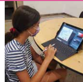
SESSION 2 August 15-26

Graphic Design Campers will learn the fundamentals of graphic design through a series of hands-on, creative projects. Campers will develop a body of work that expresses their voice as they explore and play with fonts, images, layering, digital drawing, and photomanipulation tools and techniques.