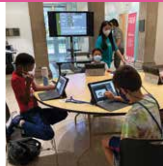
SESSION 2 July 18-29

Digital Animation For kids who love cartoons and animated movies, this class teaches the core skills needed to become the author, director, and animator of your own cartoons. Learn traditional, as well as digital 2D animated motion production techniques, to bring your characters to life and turn your stories into original animated short films.