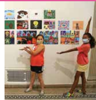
SESSION 3 August 1-12

Digital Animation For kids who love cartoons and animated movies, this class teaches the core skills needed to become the author, director, and animator of your own cartoons. Learn traditional, as well as digital 2D animated motion production techniques, to bring your characters to life and turn your stories into original animated short films.