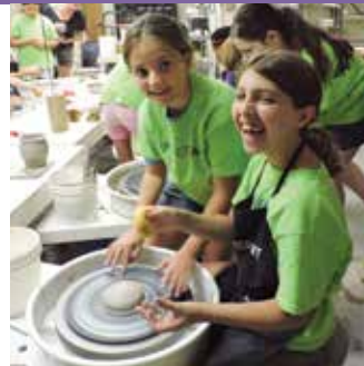
Pottery Camp: On the Wheel

Taught in our Ceramics Studio, Pottery Camp is for children who are interested specifically in exploring the tactile art of working with clay. Campers will work on the wheel and gain a solid foundation of throwing techniques while creating bowls, pots, vases, and more. All works will be glazed and kiln-fired to be treasured for years to come!