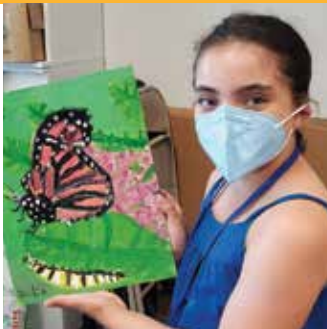
Drawing and Painting Ages 9-12

Sharpen observational and representational skills while learning essential drawing and painting techniques. Experimenting in both dry and wet media, campers will explore the properties of line, value, color, texture, and composition, while developing their artistic vision and enjoying being creative with other young artists.