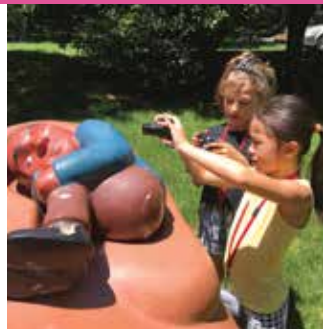
SESSION 1* July 5-15

Digital Photography Campers will explore and capture the world around them using digital photography. Campers will learn about light, contrast, composition, camera settings, and image editing with Photoshop CC, to gain a solid understanding of how to maximize the use of a digital camera to create unique and beautiful works of photography. Canon point-and-shoot cameras are available, but campers may bring their own as well.